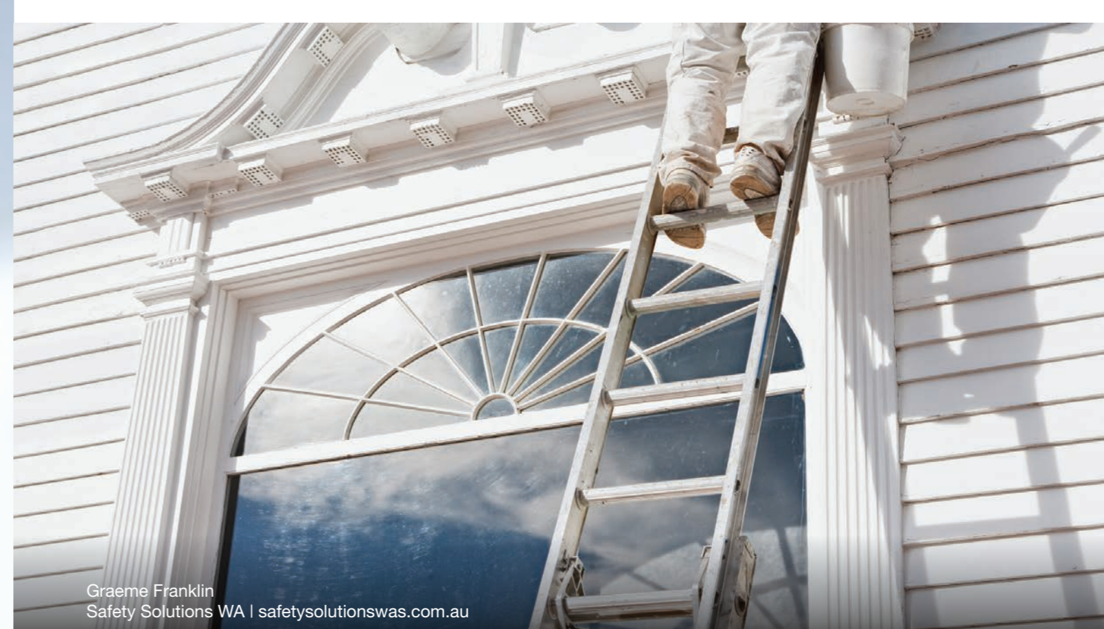
Graeme Franklin Safety Solutions WA | safetysolutionswas.com.au

Low in VOC and with virtually no odour for less disruption, so rooms can be re-occupied sooner; in clinical situations and for commercial and industrial applications, early re-occupancy minimises down-time.